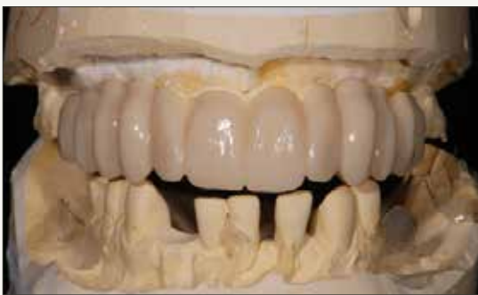
Provisionals from Digital Diagnostic Wax-ups